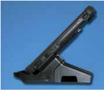
Stylish, Space-Saving Rugged Tablet Includes Docking Station