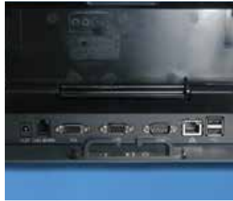
Lift the Rear Panel to Access the Docking Station's Ports