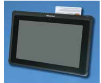
Integrated Card Reader Standard